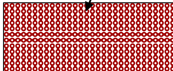
SB300 PC BreadBoard